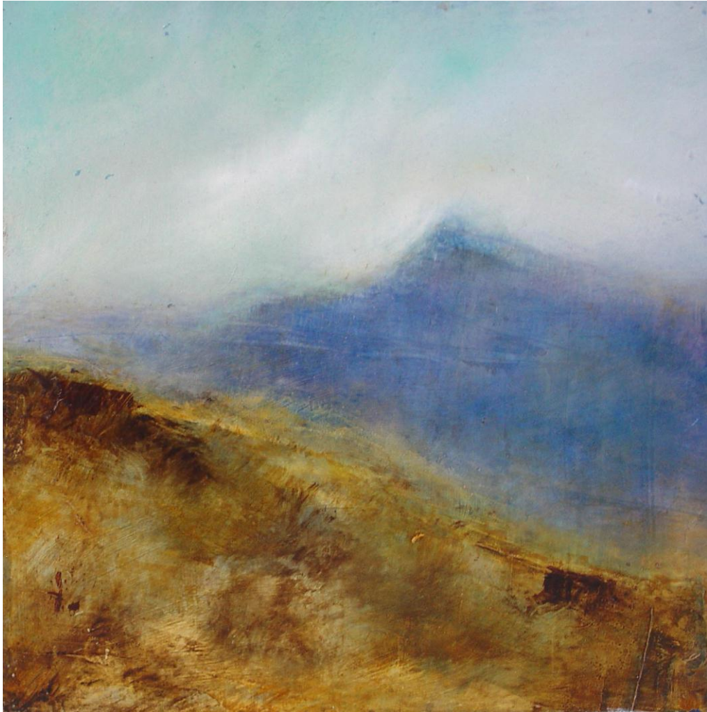
Untitled 4 2006 Oil on board. 30 x 30 cms