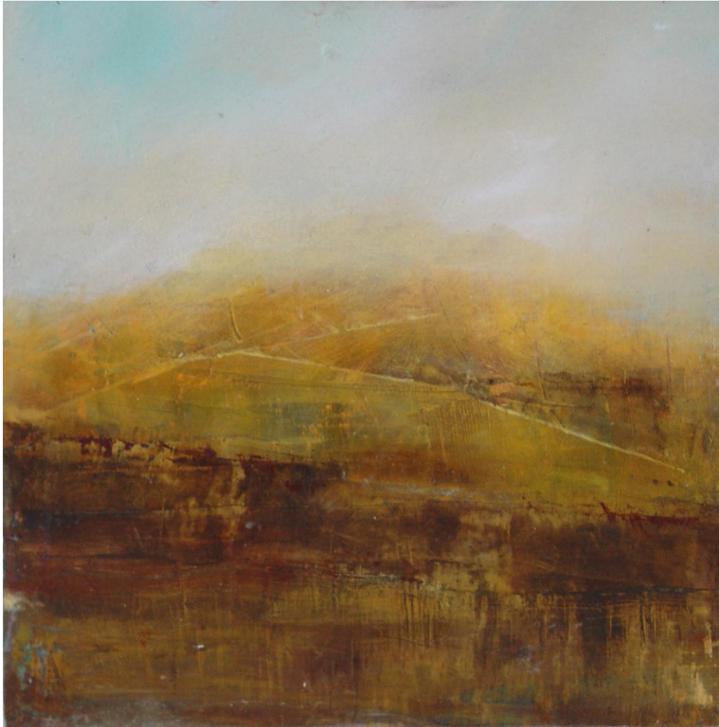
Untitled 3 2006 Oil on board. 30 x 30 cms