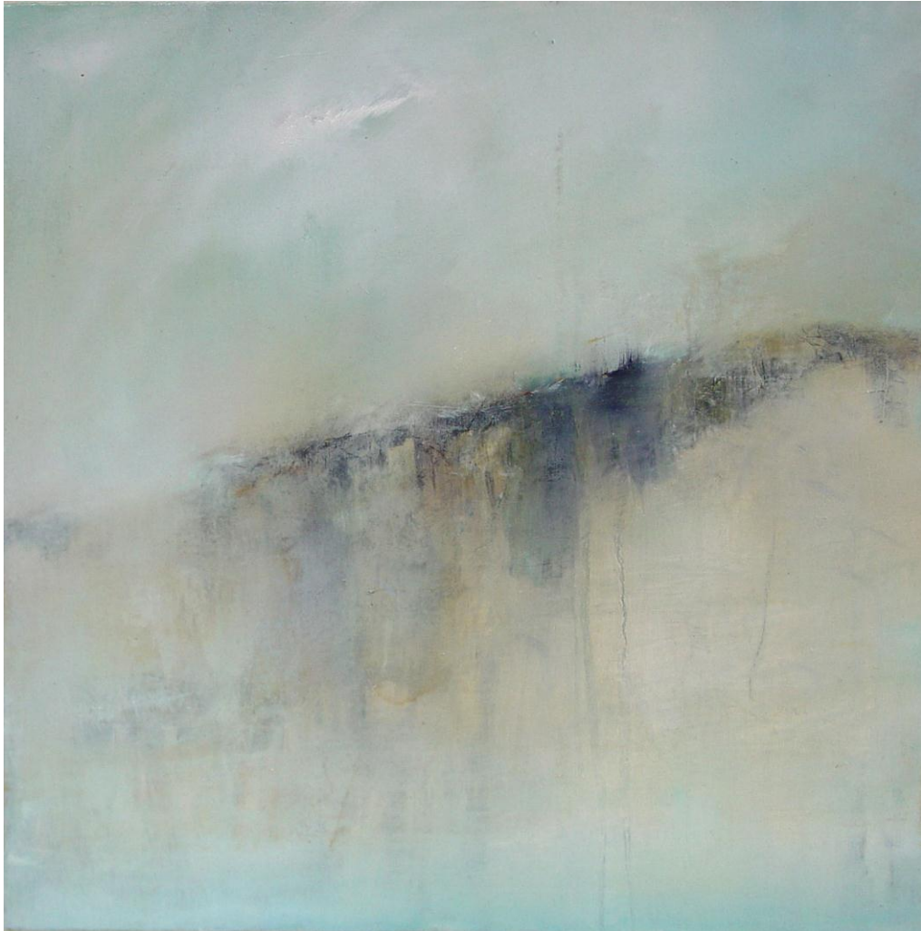
Untitled 12 2006 Oil on canvas. 51 x 51 cms