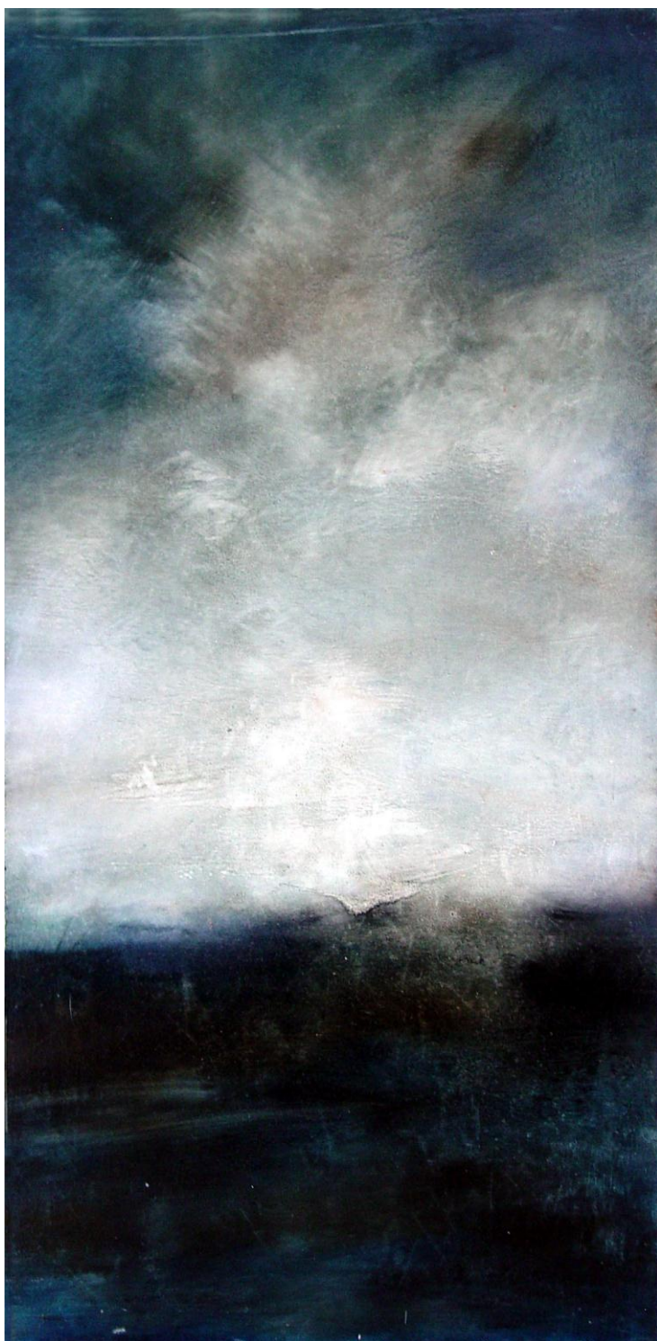
Untitled 10 2006 Oil on board. 61 x 30 cms