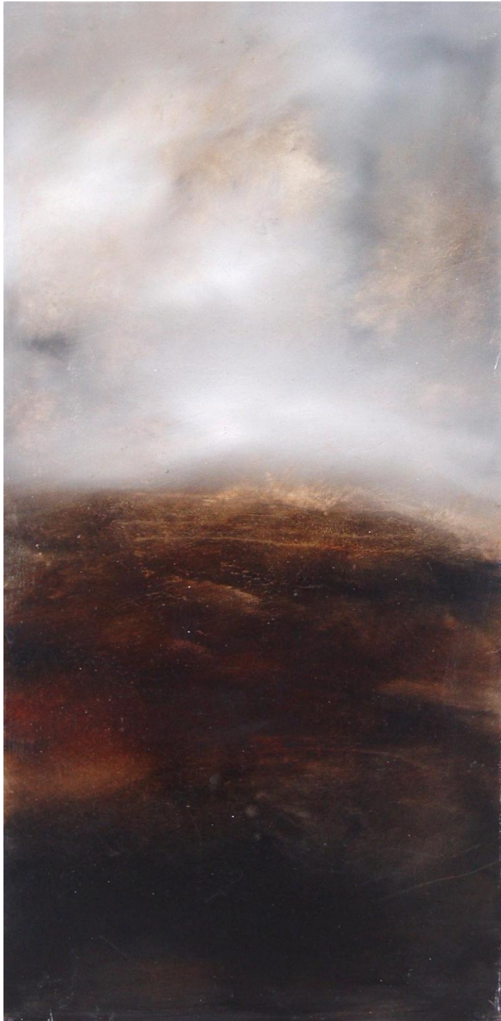
Untitled 8 2006 Oil on board. 61 x 30 cms