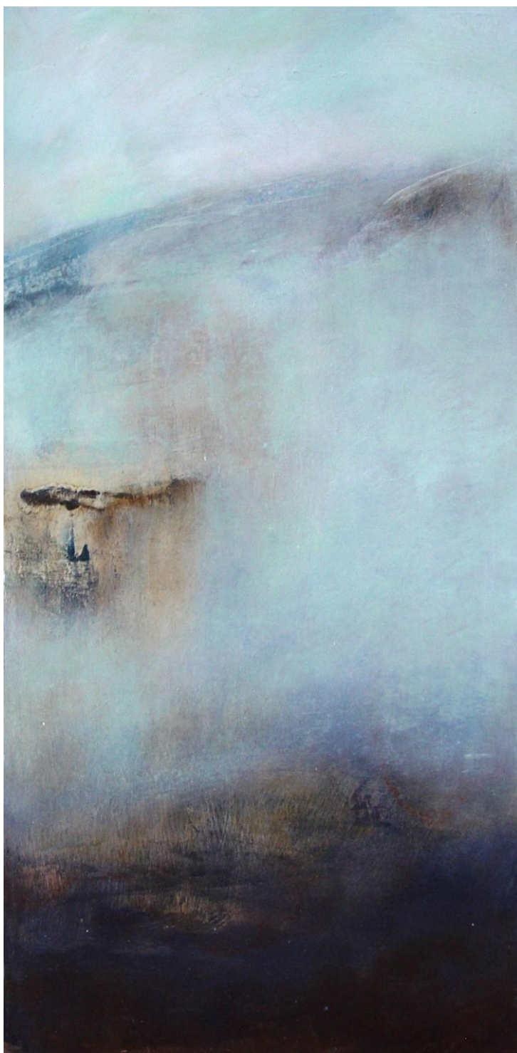
Untitled 9 2006 Oil on board. 61 x 30 cms