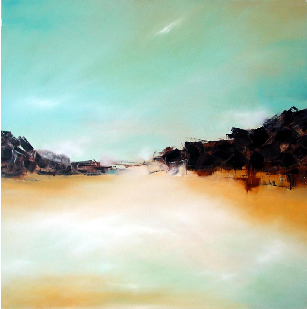
Untitled 15 2006 Oil on canvas. 102 x 102 cms