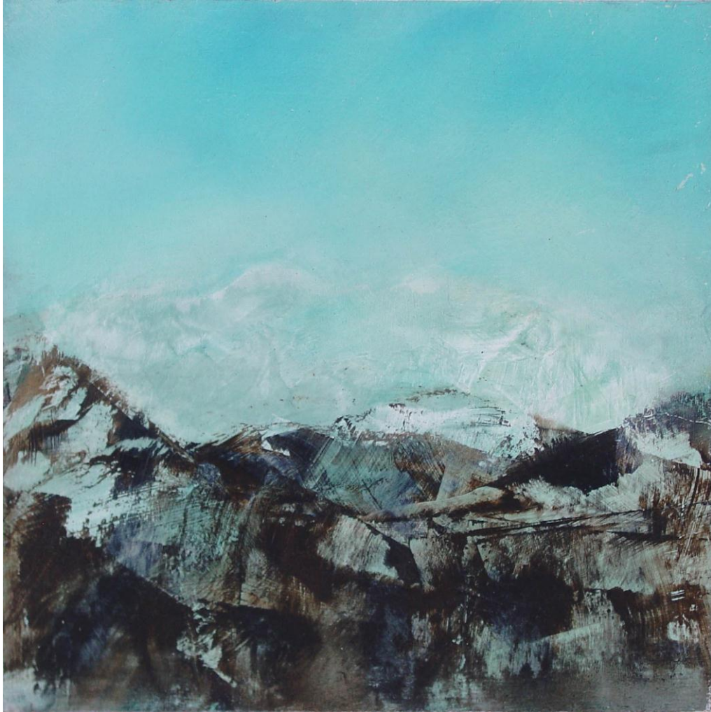
Untitled 2 2006 Oil on board. 30 x 30 cms