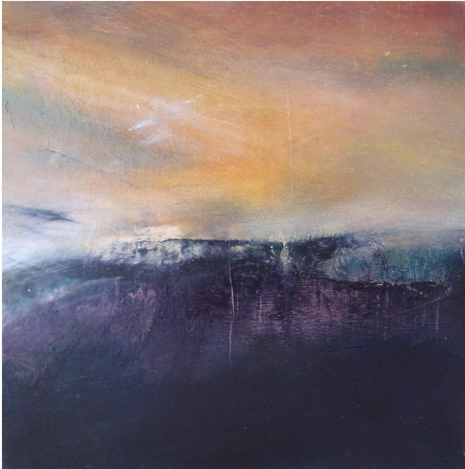
Untitled 16 2006 Oil on board. 30 x 30 cms