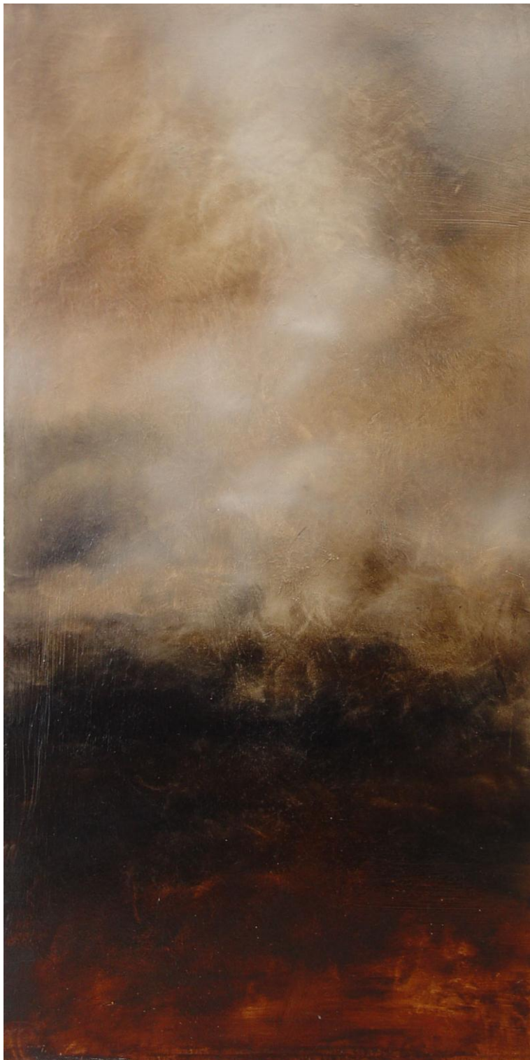
Untitled 7 2006 Oil on board. 61 x 30 cms